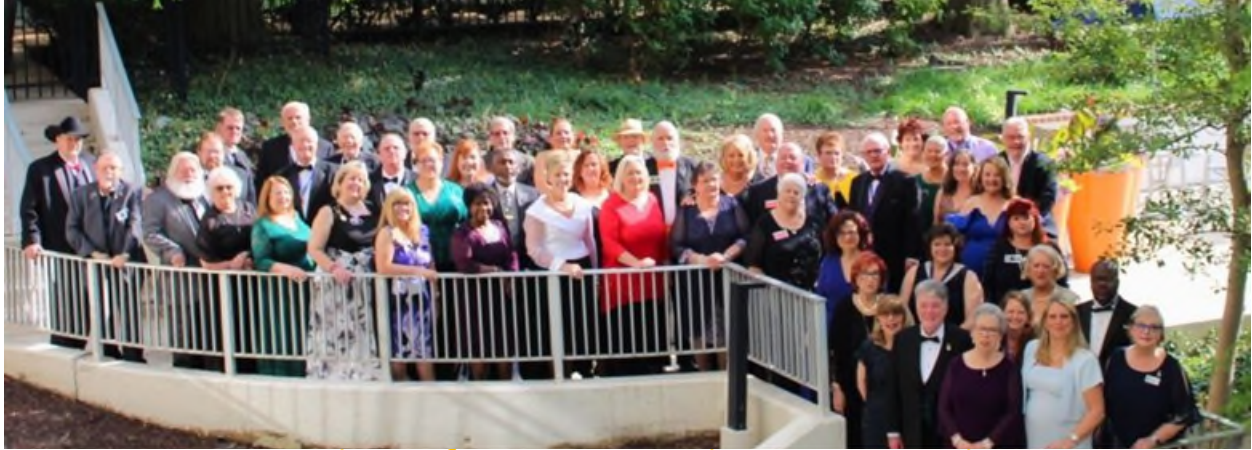
Greetings from St. Louis, MO Meeting!

Being told you're appreciated is one of the simplest, yet most incredible things you can ever hear.